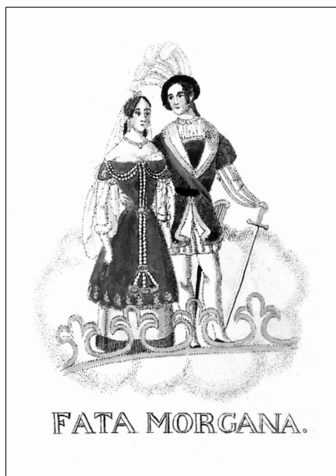
Johanne Luise Heiberg and N.P. Nielsen in Fata Morgana (1838) (Colored copper engraving by Christian Wolmar Bruun in his Danske Theater-Costumer , Copenhagen: n.p. 1826.)

imaginary picture of the princess in his mind, but this is discarded when he perceives her true beauty in person, that is, the empirical beauty that corresponds to the speculative Concept. At the end Clotaldo enjoins the audience to a similar act of rebellion. When he receives the Duke's sword for his heroic services, he declares, "With this sword I will be reminded of / The fight which is made for the actual; / And the poet in his world of images / Shall not himself be held in illusions / But struggle for the real truth." 1 Finally, in his triumphant speech to Fata Morgana, Clotaldo defiantly exclaims in their decisive violent encounter, "Poetry is truth, although it / Consists of images." 2